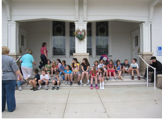
Field Trip 4/14/11

Touring these Allen historic sites have provided the students with the physical experience to help them grasp their cultural heritage rather than merely reading about Allen's history in the classroom.