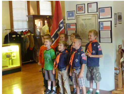
Tiger Cub Pack 1630